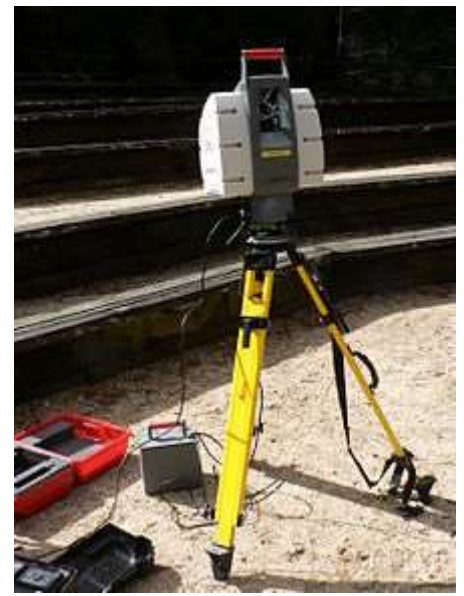
Figure: LIDAR laser scan technology in building construction work

The LIDAR laser scanning technology is will be used in the conjunction with 3D printers and helpful for the manufacture and replace building components. LIDAR is a most accurate and effective way to capture the data and record the data. Lidar scanner will give the accurate 3D images and provide the actual image of an object. This in turn might be linked to interim payments for contractors.